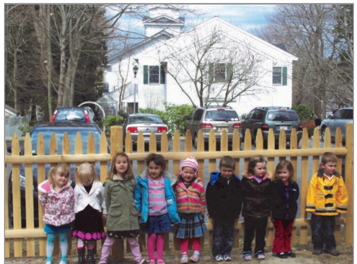
Students with their new playground fence