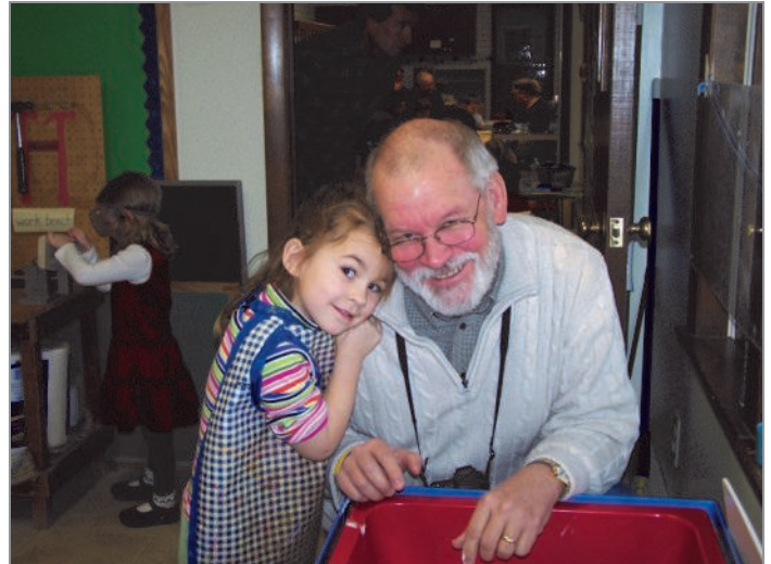
Joyful Noise celebrates family members